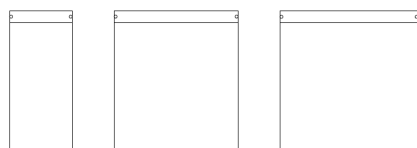
Measurements in mm