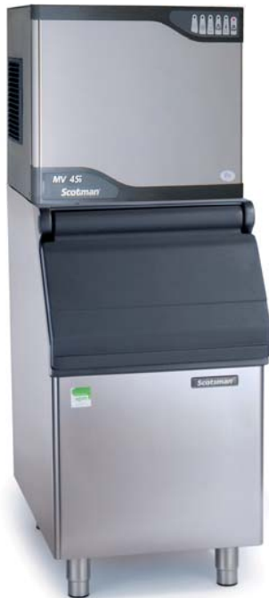
MV 456 with SB393 (sold separately)