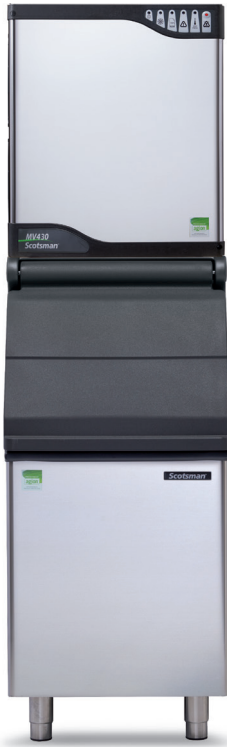
MV 430 with SB322 (sold separately)