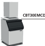
MV430+SB530+Top (sold separately)