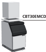
MV430+SB393+Top (sold separately)