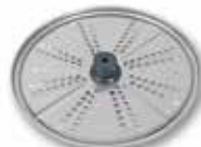
SHSF / SHSG