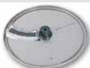
FCS / FCOS