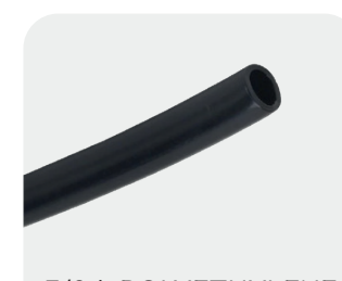
3/8th POLYETHYLENE TUBE DM-DPE06-BK