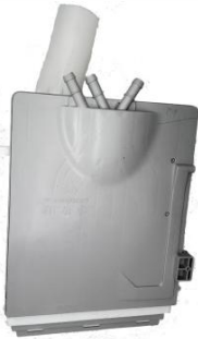
Complete Detergent Drawer - CWP8019