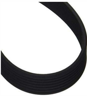
Drive Belt - CWP8013