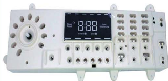
PC Board - CWP8005