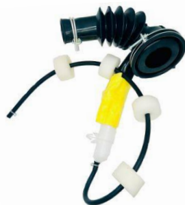
Tub Drain Hose Assembly - CWP0800