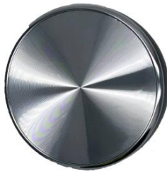
Control Knob - CWP8521