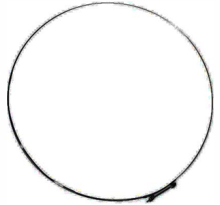
Door Gasket Inside Clamp - CKP0225