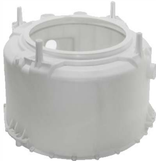
Front Plastic Tub - CWP8520