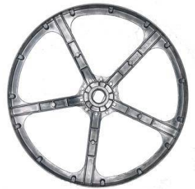
Rear Flywheel - CWP0146