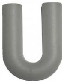
Detergent Siphon Pipe - CKP0219