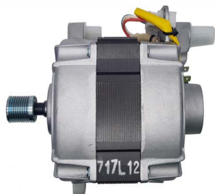
Motor - CWP8006