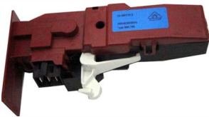
Door lock Mechanism - CKP0819