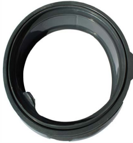
Door Gasket - CWP8002