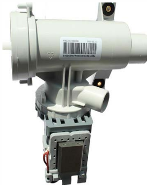
Drain Pump - CKP0226