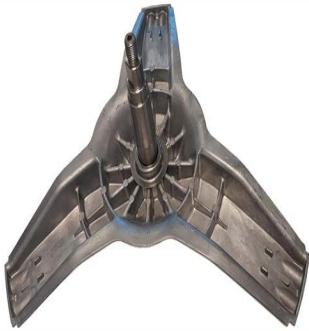
Drum Spider - CWP0094