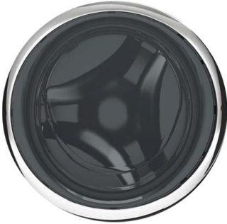
Full Door Subassembly - CWP8008