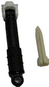
Damper & Pin - CWP8014