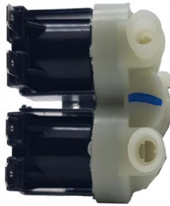
Inlet Solenoid - CKP8205