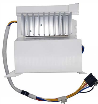
Inverter - CWP8007