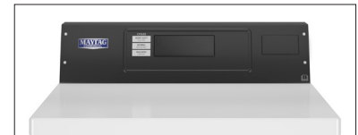
CARD READER READY MDE20PNAGW pictured (Also available in Gas)