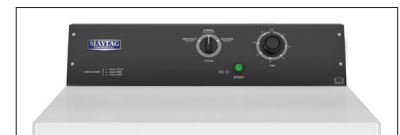
NON-VEND MDE20MNAGW pictured (Also available in Gas)