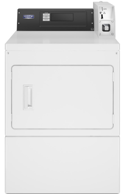
COIN DROP EQUIPPED MDE20PDAGW pictured (Also available in Gas)