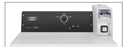
COIN SLIDE READY MDE20CSAGW pictured (Also available in Gas)