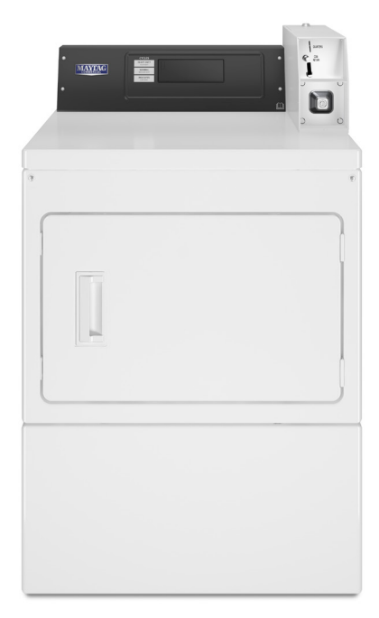
COIN DROP EQUIPPED MDE20PDAGW pictured (Also available in Gas)