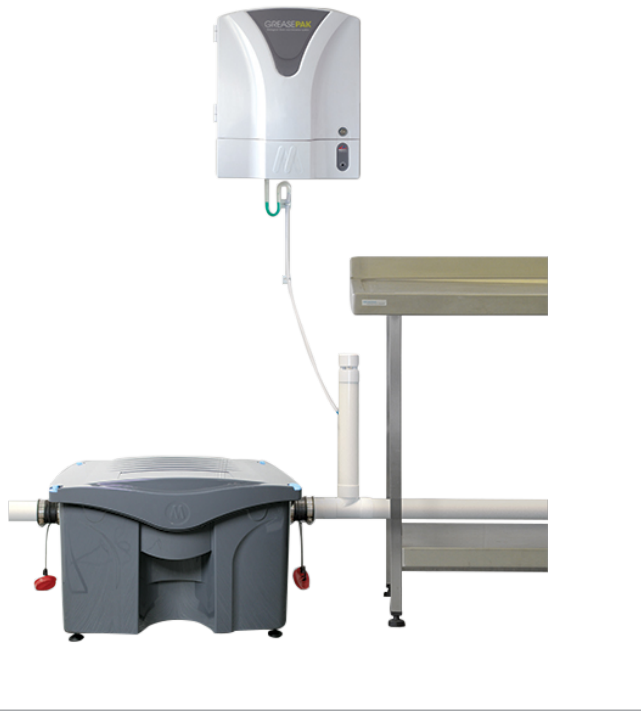
BioCeptor F.I.T Unit: