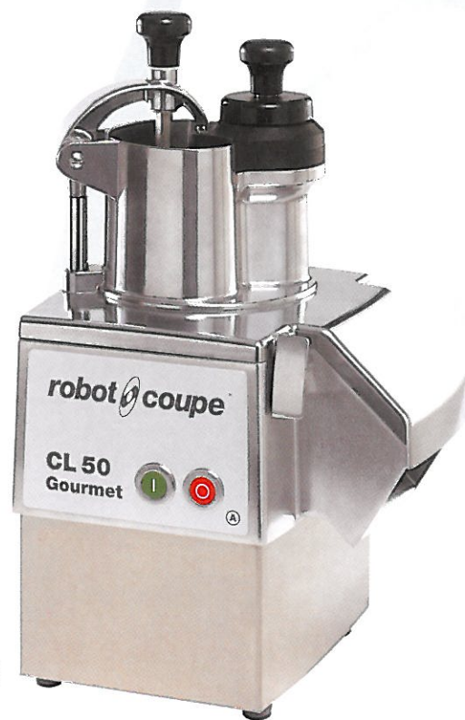
Illustration 2 Savings on Pre-prepared Produce

With a CL50 there is no need to buy in expensive pre-prepped vegetables. Improve the quality of your veg and save money.